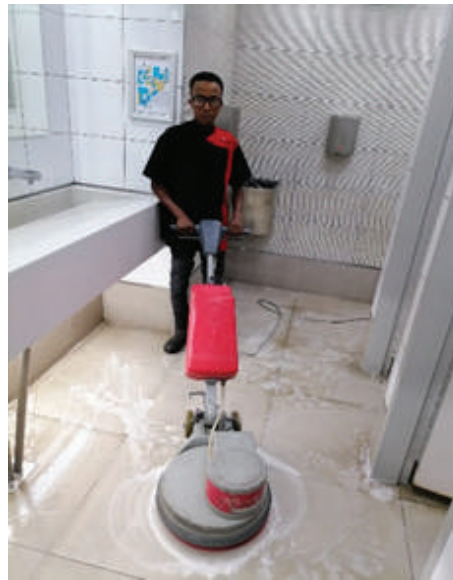
DEEP CLEANING OF BATHROOM FLOORS