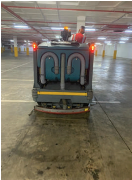
M20 RIDE ON AUTO SCRUBBER – PARKADE / BASEMENT CLEANING

What often goes unnoticed is the remarkable array of equipment at our disposal, enabling us to provide diverse services to our clientele. From the sophisticated M20 ride- on auto scrubber, perfectly suited for large areas that require cleaning, such as basements, warehouses, and parking garages